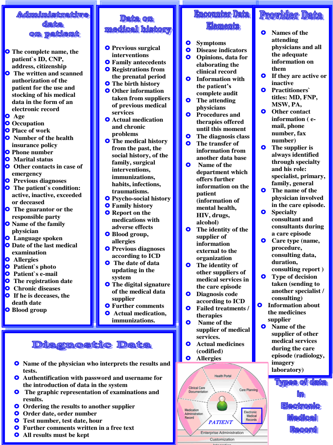
Figure no. 2 Types of data in EMR